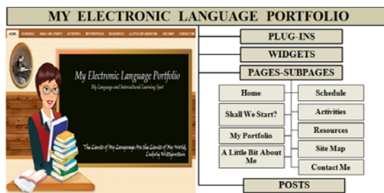
Figure 1: 'My Electronic Language Portfolio' architecture

Intensive consideration for the above-mentioned benefits of Wordpress as a CMS has guided the ePortfolio tool adoption process and the creation of the Web 2.0 based language portfolio presented within the context of this paper. In Figure 1, the ePortfolio architecture is depicted.