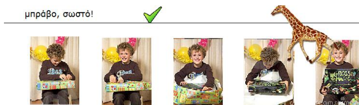
Figure 3. A "present" is given every time user puts an image in the correct place.

The system provides sound messages. Text messages are presented too, in order to build a relationship between images and words. In evaluation module, user's performance is recorded, stored and compared with previous user's attempts in the same story. Depending on results, in reflection module the system picks up the same subject matter for example "how to open a present" with different images. This is needed due to the need of abstract conceptualization of the social skill presented. Therefore another story is presented to make sure the learner understands the particular skill independently of the particular sequence. A "present" is given every time user puts an image in the correct place. People with ASD are very fond of animals, thus the present is an animated animal that places itself in a different space in the screen than user's working space in order to prevent disturbances in the main working area that could confuse and annoy the autistic student (figure 3).