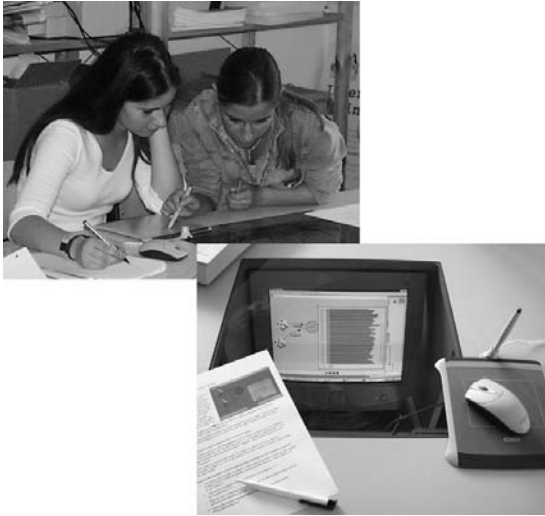
Figure 3: Modelling tools for stochastics

Figure 4 is taken from a biology course in 12 th grade on system dynamics (exponential and logistic population growth, consumption of natural resources, interacting populations such predator-prey models). In the concrete situation, the teacher works with a big interactive display using the NoteIt free hand annotation tool. A scanned-in image of the development of coffee production in Brazil has been loaded into a NoteIt page. The data show a periodic pattern but also an increase over time. The teacher wanted to construct a linear approximation of this overall increase. Since NoteIt does not provide parameterised geometrical shapes but only free hand input, he took a ruler designed for the chalk board to draw a straight line on the electronic board. The result was perfectly OK, but the teacher articulated afterwards that he felt uneasy using the physical device as an add-on to the digital representation. He thought the computer tool should provide a line drawing operation and found that his “fuzzy” way of achieving the goal was inferior to a “clean” computer operation.