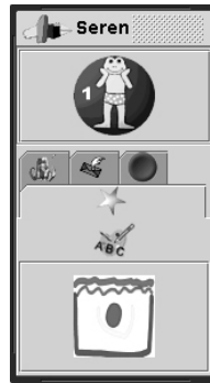
Figure 2b: A companion showing a child's data

To make sure that new media technology supports learning and does not negatively interfere with well suited pedagogical procedures, we studied existing interactions and curricular activities in the three NIMIS primary schools. Although the new technology should not redefine pedagogy, new roles can evolve from these special environments for the teachers and the children. Teachers act as information managers, and thus have to learn about new ways of accessing information and to judge and handle qualitative new kinds of information. The same is true for the children: Without explicitly mentioning the computer as a topic, the children get used to managing their own data and to working with different devices and in different group constellations.