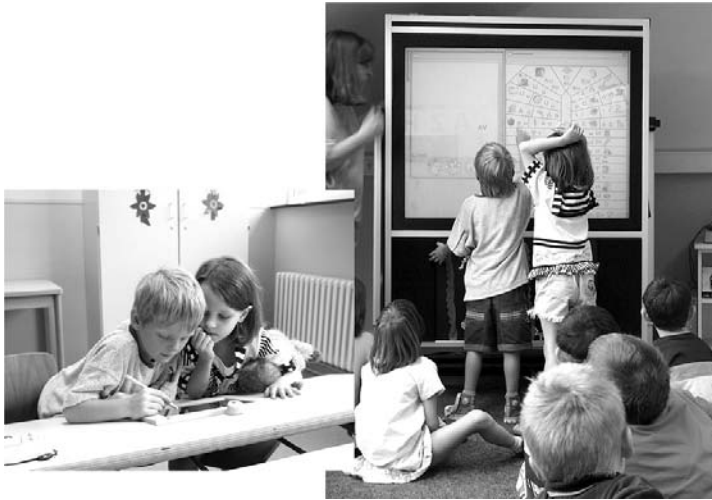
Figure 1: Scenes from the NIMIS classroom in Duisburg

installation with integrated hardware components and a big interactive board. The installation at a Duisburg public primary school is still in everyday use. Similar classrooms have been installed in a Portuguese school near Lisbon a rural school in England.