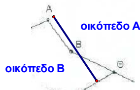
Figure 1. Where are we to place the line so that the two exchanged areas are equal?