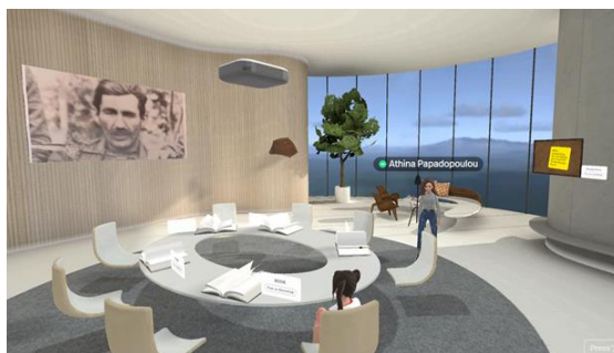
Figure 72. Overlook of the social VR meeting space

Another crucial component of this study was the use of virtual worlds in the Metaverse. As alluded to previously, social VR’s ability to transcend geographical limitations and foster synchronous collaboration represents a significant advancement in the educational landscape. This technology empowers learners to convene, engage in idea exchange, and expand their knowledge base, all from the convenience of their personal spaces. In alignment with these objectives, the current study utilized Spatial.io, a freely accessible Metaverse platform. Namely, the developed space ( https://www.spatial.io/s/Minor-Asia-Catastrophe-History-Workshop-64a5afb62044c35d4b918bbf?share=7099300977218985086 ) served not only as a virtual meeting place but also as a repository for all lesson materials, including the e-book, reflective activities, and the hosting space of the evaluative interviews of this experiment.