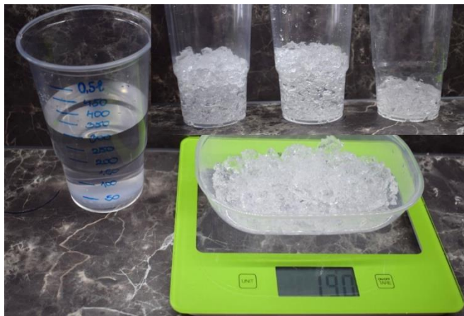
Figure 1. Absorbency of hydrogel depending on different kind of water

The hydrogel is also very sensitive to the salt content, and therefore in saline or in combination with some fertilizers, it only soaks up a small amount of liquid (Radwan et al., 2018).