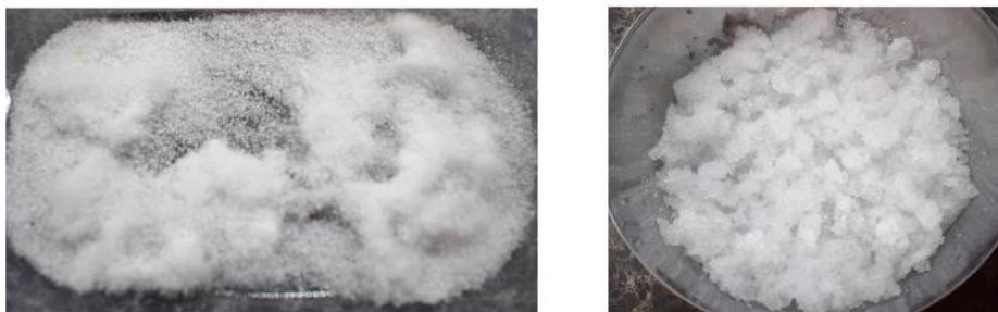
Figure 4. Demonstration of hydrogel from the diaper in the dry state and after soaking

The soaked hydrogel can be used for further cultivation experiments or added to a garden compost, which will increase moisture of the soil. (Havlík et al., 2016)