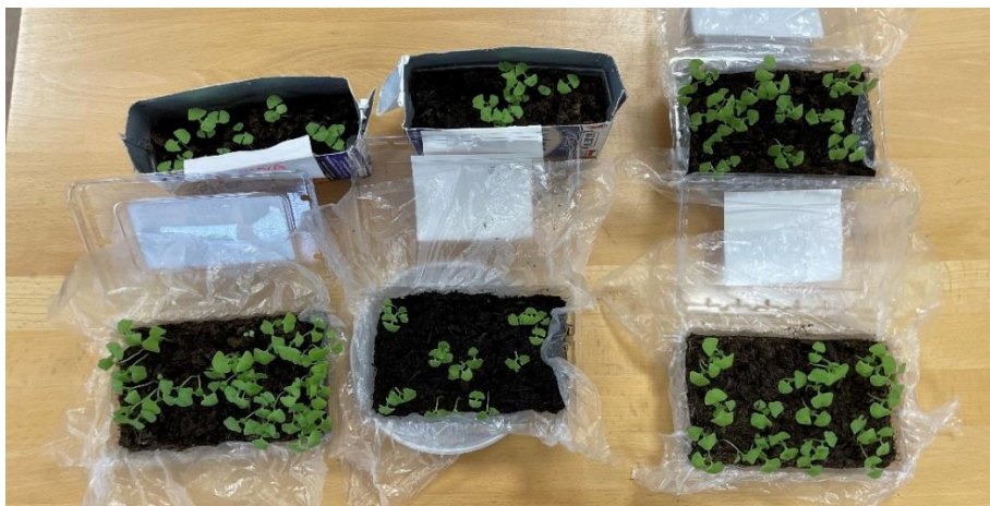
Figure 5. Example of growing basil in different soil combinations mixed with hydrogel