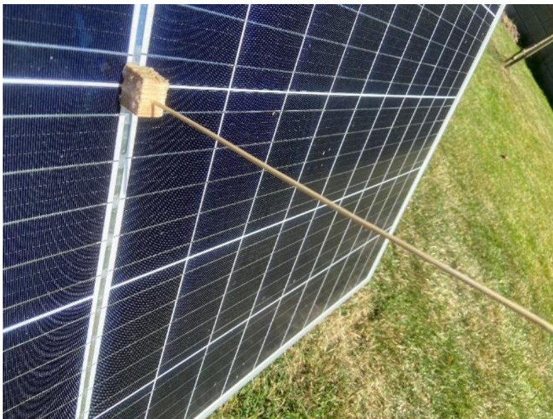
Figure 1. Panel with a wood skewer

The measurements were carried out at an outdoor temperature of 30° Celsius at 15:00. The panel temperature was 50° Celsius. A skewer was used for the measurement which was attached to the panel using a hot melt gun. It was then inserted into a small auxiliary prism. This skewer was used as a shield to show us the angle at which the sun's rays were hitting the panel and therefore the angle at which the panel was tilted. In the picture we can also see the shadow cast by this skewer on the panel. See the attached photograph.