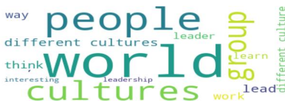
Figure 4. The word cloud generated by RAKE.