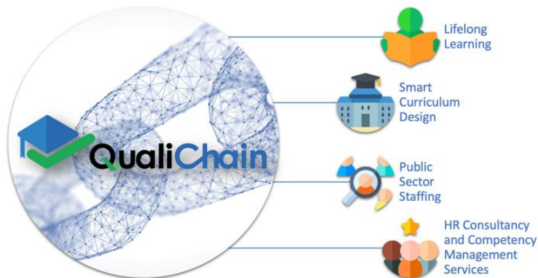
Figure 2. The key areas targeted by the QualiChain project.

educational institutions, upon reaching certain milestones in their studies, e.g., completing part of a course or an entire course. Smart Badges are stored on the Blockchain, thus ensuring the validity of the awarded accreditation and eliminating the risk of fabricated qualifications. Smart Badges include data about the key skills that learners have acquired upon obtaining these badges.